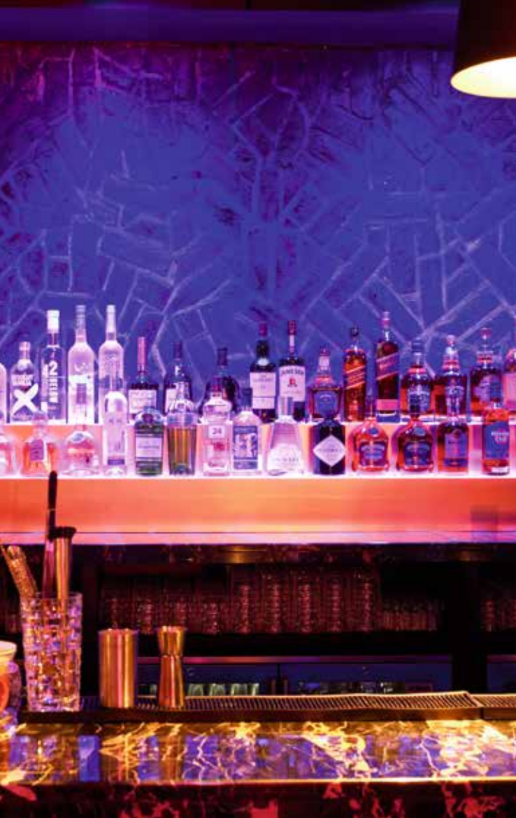
• Above left The bar