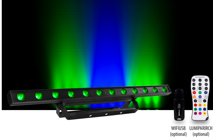
WIFIUSB (optional) LUMIPARIRCH (optional)