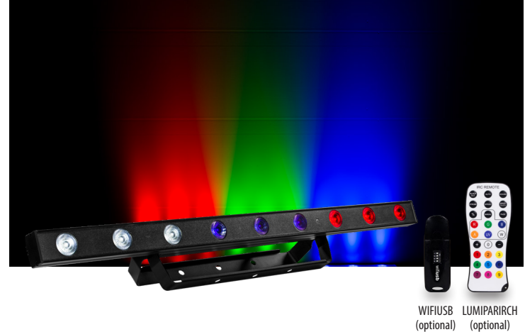
WIFIUSB (optional) LUMIPARIRCH (optional)